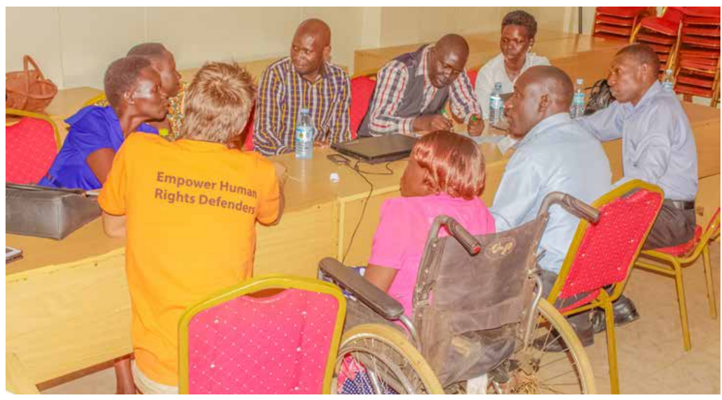
HRDs in a land dialogue convened by Action Aid Uganda on 12<sup>th</sup> April 2017 in Lira district.

he work of Human Rights Defenders often has them pitted against the state and its institutions because it involves protecting the vulnerable from the excesses of rights violators. HRDs are therefore seen as 'saboteurs of development' because their interventions contravene the operations of both state and private.