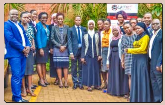
LASPs and partners who attended the validation meeting for the access to justice indicators held on 28^{\rm th} February 2017.