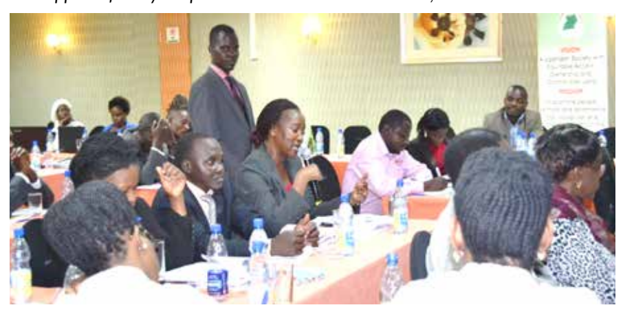
Participants during the plenary.

it because of its implication on securing land rights. . She also confirmed that illegal titles would be cancelled. "I need to deliver a public good which is why I seek the support of everyone present on how best to deliver it", she concluded.