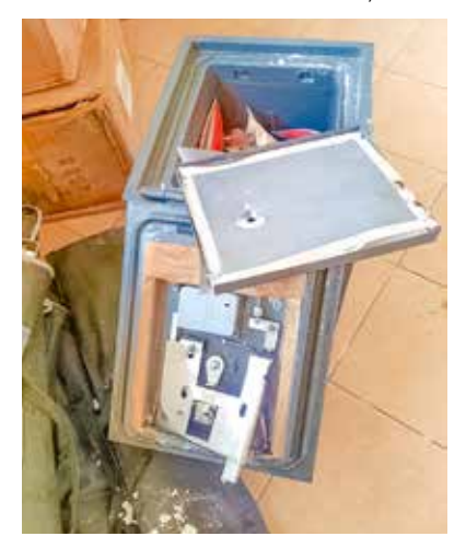
ABOVE: The vandalized safe.

The support from members, partners and stakeholders who stood in solidarity with the Network during that critical moment was commendable. Some of them included; DPI, HRCU, NCHRD-U, HRNJ-U, Chapter Four Uganda, HRAPF, among others •