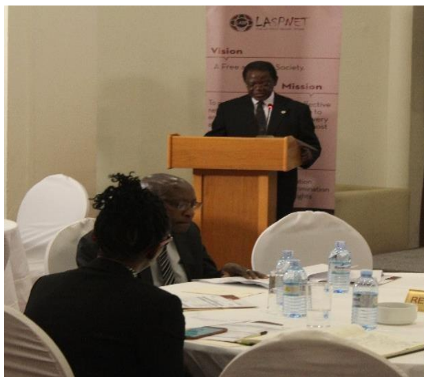
Hon. Justice Remmy Kasule giving a Key Note Address.

The Conference was officiated by the Hon. Justice Remmy Kasule, Judge of Court of Appeal who also delivered the key note address. Justice Kasule underscored the fact that corruption remains a severe impediment to the realization of Access to Justice. Noting that Justice institutions such as Police and Judiciary have not been spared by the vice.