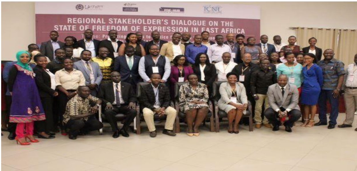
A group photo of the participants at the dialogue.

LASPNET with funding from ICNL organized a Regional stakeholders' dialogue on Freedom of Expression and Access to information under the theme: "Promoting Access to Justice for journalists: Perspectives from East Africa on how to build a resilient legal aid response mechanism. " The dialogue which kicked off from 23rd to 24th August 2019 was held at Best Western Hotel and was attended by a total of 70 delegates from different East African countries i.e. Uganda, Kenya, Tanzania, Rwanda, Burundi and South Sudan. More still, the delegates were drawn from different sectors including: Development partners; CSOs; Government MDAs; Judiciary; Academia; Paralegals and Media.