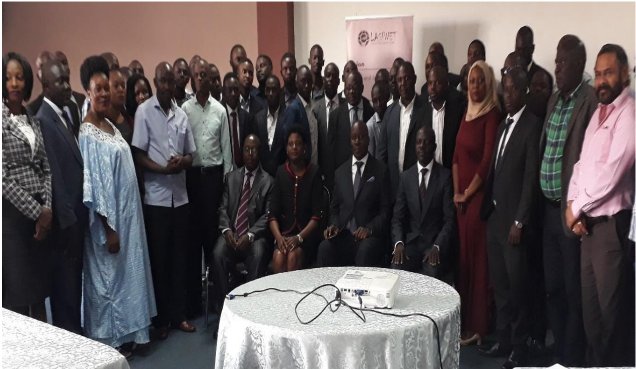
A group photo of the participants who attended the Bailiffs training at Silver Springs, Bugolobi.

At the end of the training, the participants had grasped the key concepts under execution of court orders and equipped with skills and knowledge as observed in the breakout sessions. Also key to the training was the fact that many expressed interests to join the LASPNET/UCBA probono project on execution of Court orders.