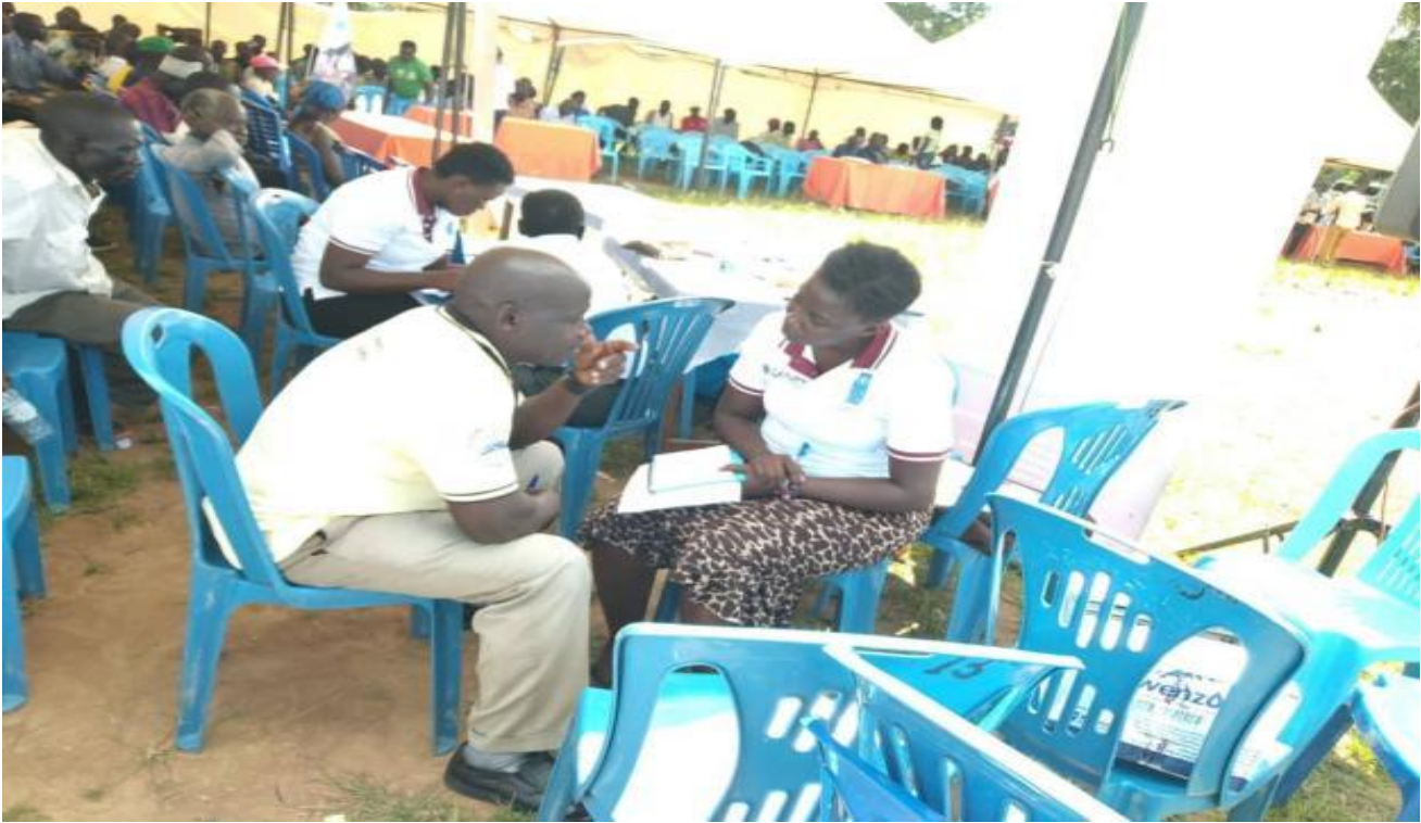
One of the lawyers attending to a client during the outreach.

inheritance of property; rights of spouses during and after dissolution marriage; child neglect and failure of parents to provide and meet educational needs of their children; delays in disposal of cases both at Legal Aid Clinic and in Courts of Law and corruption in the judicial system.