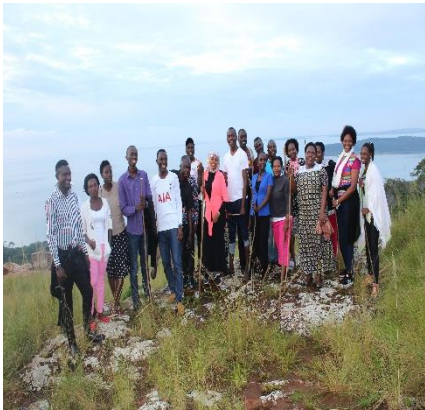
Some of the epic moments at the 2019 Staff Retreat.