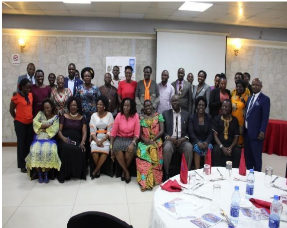
Participants pose for a group photo at the National Consultative Meeting.

LASPNET with support from UNDP under the “Spotlight Initiative” held a consultative meeting with the Uganda Parliamentary Women's Association on 25th November 2019 at Hotel Africana. The intention of this meeting was to engage Women MPs and enlist their support and views into the proposed Legal Aid law. A total of 41 (13 Male: 28 Female) participants including Development and strategic partners; MPs and LASPs attended the meeting.