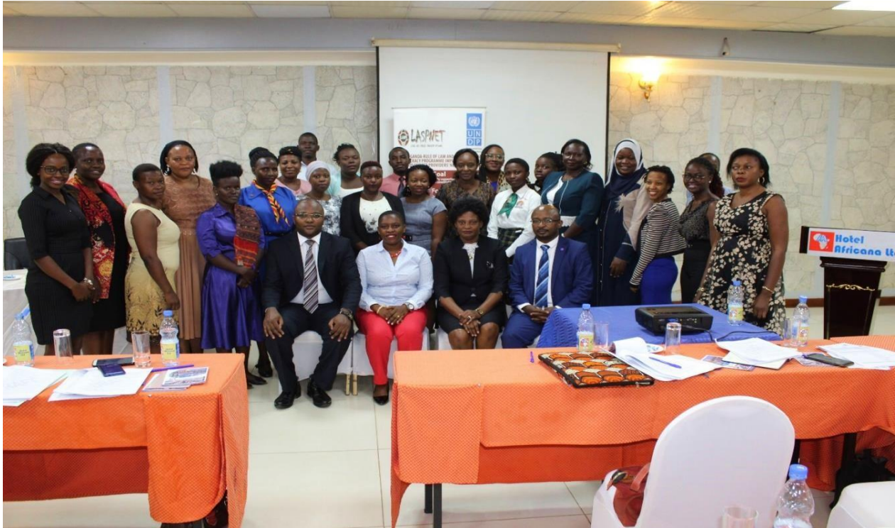
A group photo of the participants who attended the Women and Girls Groups Meeting at Hotel Africana.

On 19th November 2019, LASPNET with support from UNDP under the Spotlight Initiative convened a Women and Girls' groups interactive meeting to obtain their views on the proposed Legal Aid law. The meeting which took place at Hotel Africana was attended by 41 (4 Male: 37 Female) participants) including MPs; UNDP; Community and Religious Women Leaders; a Student activist and LASPNET staff.