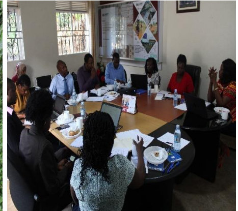
DGF Team taking LASPNET staff through an Organizational Capacity Development Assessment.