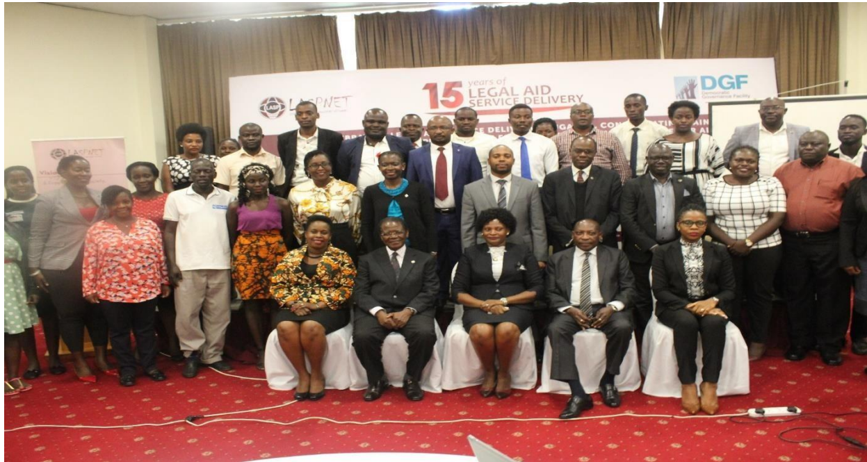
Participants pose for a group photo during the PRE-AGM Conference.

On 25th October 2019, LASPNET with support from DGF convened the 5th Annual Access to Justice Conference under the theme; "Joining efforts to fight corruption in the justice system as a Pre-requisite to enabling the poor, vulnerable and marginalized Access Justice," at Hotel Africana.