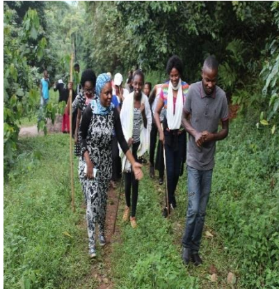
LASPNET staff take a nature walk during the retreat.