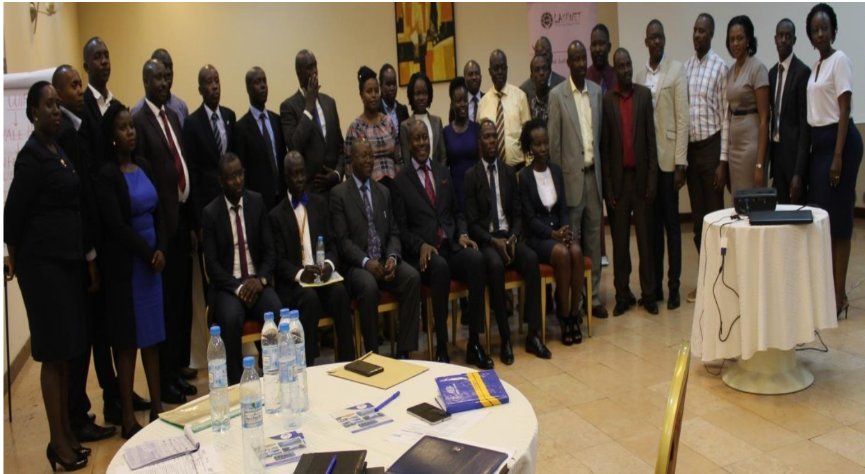
A group photo of participants at the National Stakeholders Dialogue on Execution of Court Orders. Seated in the middle is the DPP.

On the 27th November 2019, LASPNET in partnership with the Uganda Court Bailiffs Association (UCBA) and with support from the DGF held the 2 nd National stakeholders dialogue meeting on the Execution of court orders under the Theme: "The role of Court bailiffs in promoting A2J in Uganda: Drawing on lessons learnt and opportunities from the UCBA / LASPNET Execution Project." The dialogue was attended by various stakeholders who included Judicial officers; Advocates, Bailiffs, LASPs; Justice Centers Uganda and Media.