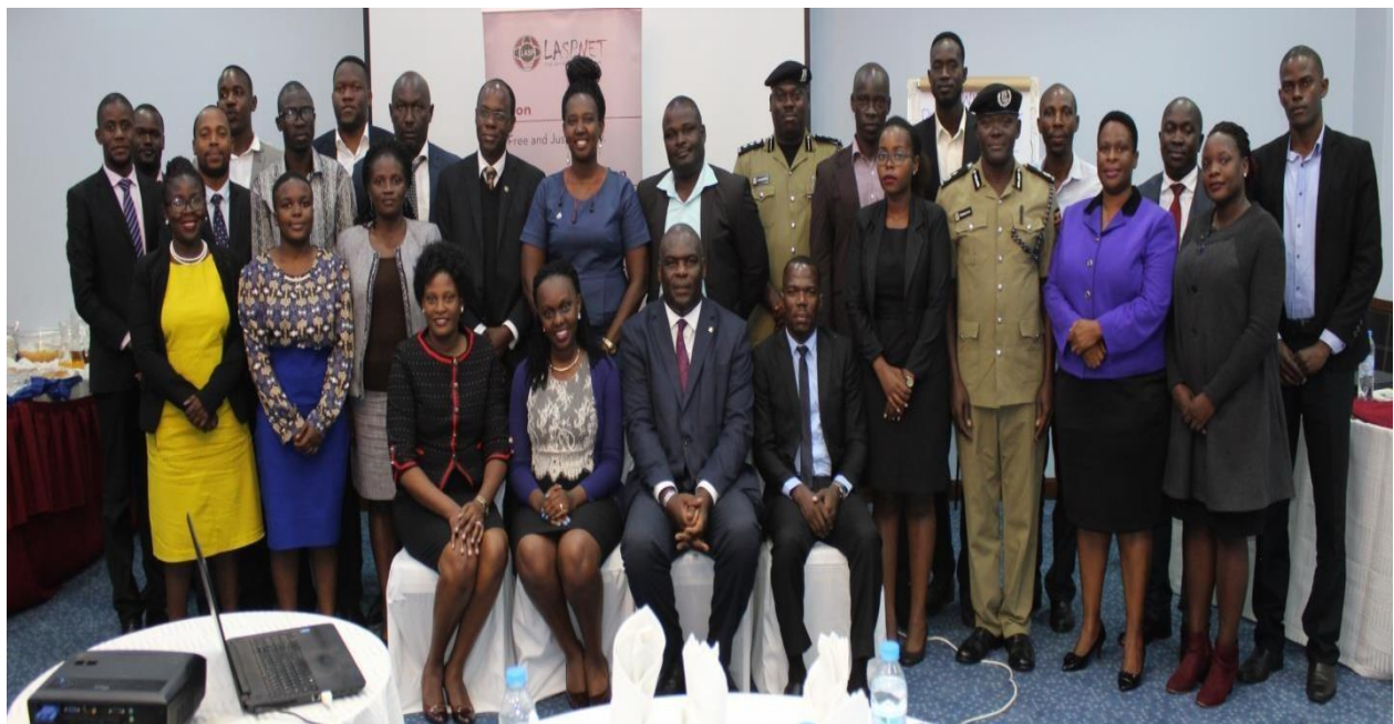
A group photo of participants at the High-Level Stakeholders Meeting. Seated in the middle is the DPP.