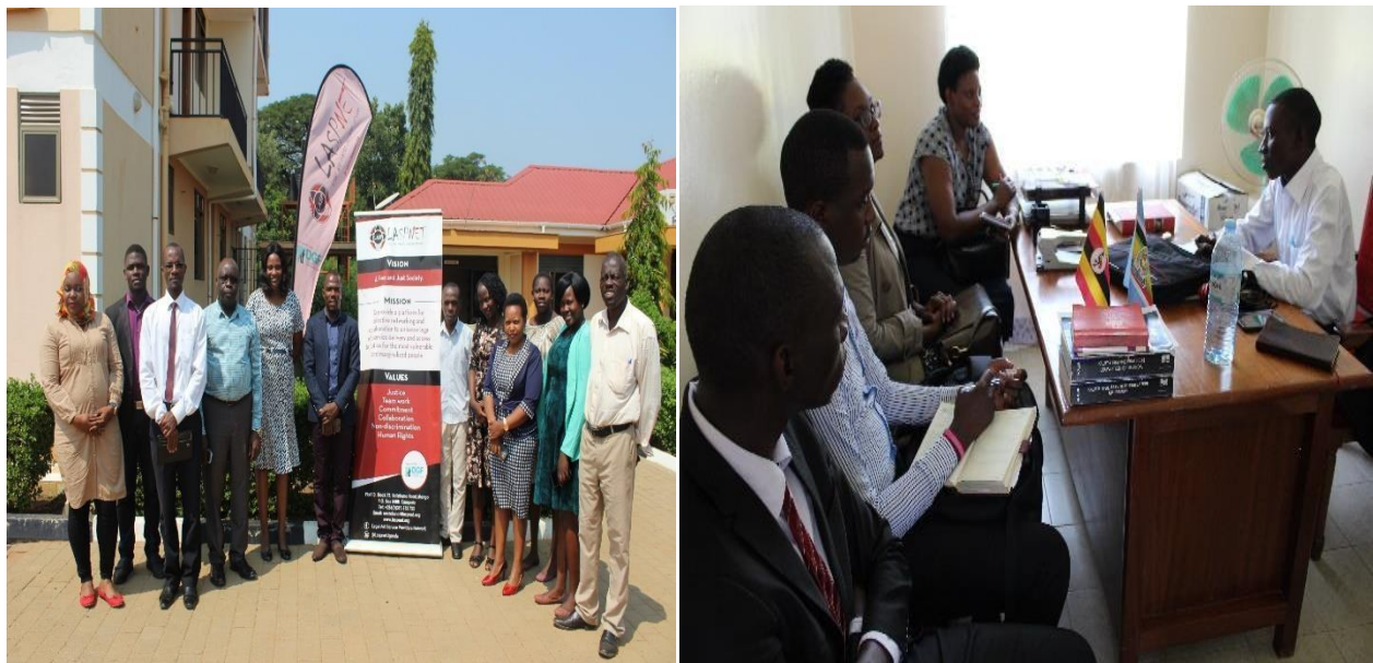
LASPNET Secretariat staff led by the Executive Director during the PLE regional visits.

The visits and regional engagement meetings provided LASPs with an opportunity to have a peer review of each other; to take stock of progress made in strengthening access to justice and devise strategies to ensure sustainability of the members among others. The meetings made key recommendations which include among others: strengthening internal accountability mechanisms; continue tracking access to justice trends; strengthening ongoing efforts of equipping communities with information on law and human rights; undertaking peer learning exchange visits amongst regional members as well as putting in place a membership monitoring unit that can undertake impromptu visits and evaluations exercise in a bid to strengthen standards and compliance of LASPs.