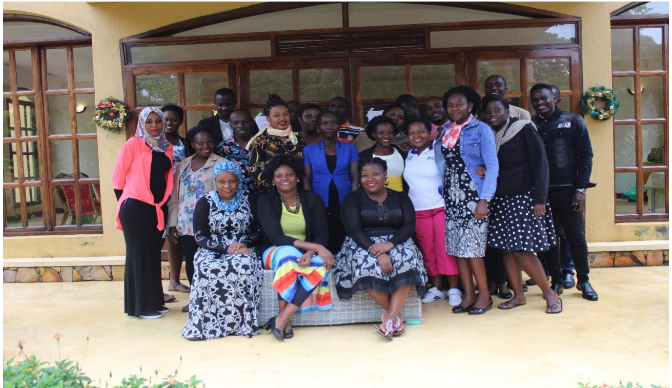
A group photo of LASPNET staff at the Retreat.

LASPNET with support from DGF held the Annual Management, Staff Review and Planning retreat from 9th to 12th December 2019 at Brovad Hotel in Kalangala. The retreat was intended to among others take stock of the year's performance including how staff had applied and used the knowledge of the previous capacity development to improve performance. During the retreat, staff were offered an opportunity to rethink working strategies to ensure effective project implementation for the year 2020.