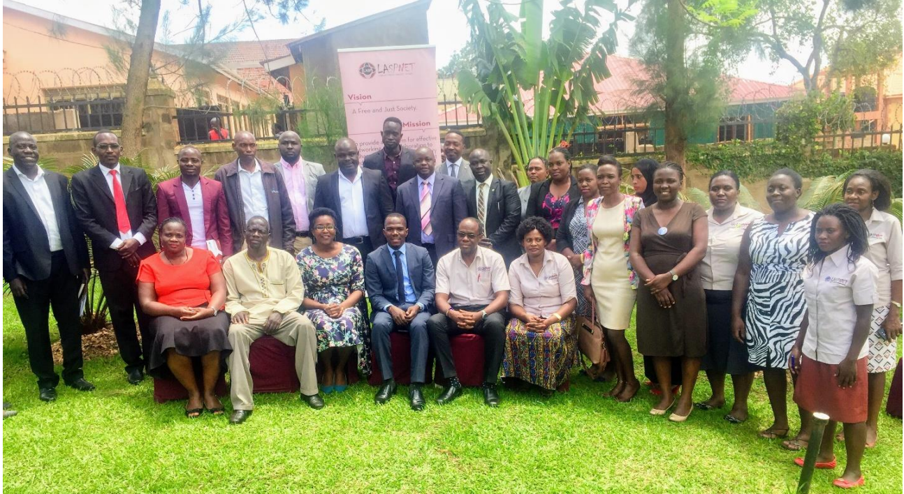
Participants posing for a group photo at the 10th Annual General Meeting.

On 25th October 2019, LASPNET members convened at the LASPNET Secretariat for the 10th Annual General Meeting (AGM). It was attended by 50 participants (27 male and 23 female) with representation from 28 organizations including UCLF; MCJL; IWILAP; UGANET and PILAC.