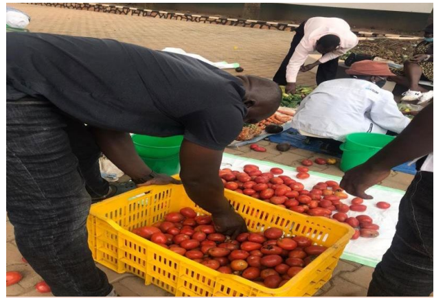
The Situation Room Coordinators sorting out the food items and a client after receiving food donated by Haba Haba

The organisation has since then made periodic