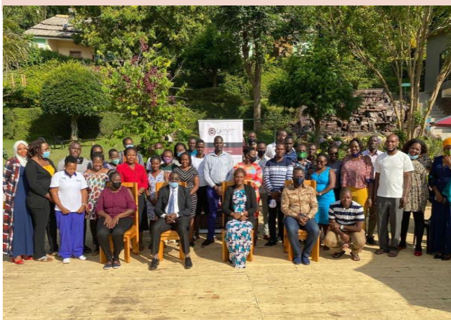
Secretariat Team and the incoming and outgoing Board.