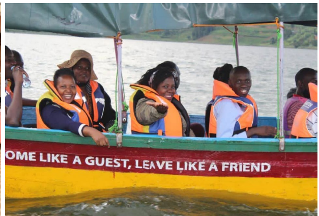
Staff Boat Ride on Lake Bunyonyi