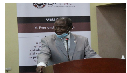
Hon. Justice Remmy Kasule, Justice of the Court of Appeal giving closing remarks at LASPNET's 11th AGM

capacities to make a viable contribution towards Access to Justice by standing up to violations of each other's rights in order to ensure protection of the law for all. To the incoming Board, Hon. Justice Remmy Kasule put them to task to ensure that they are alive to enhancing Access to Justice for all. Finally, he underscored the importance of focusing not only on public interest litigation but also on private litigation.