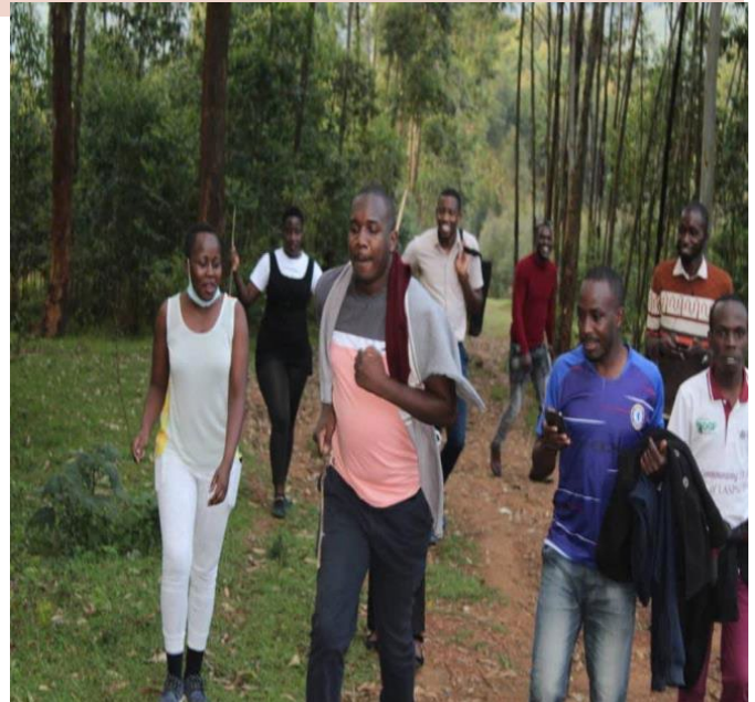
Staff Nature walks at the Retreat