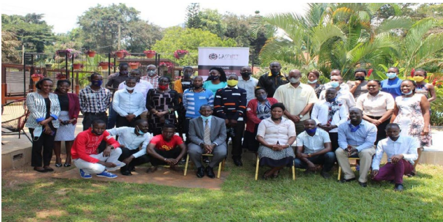
A group photo of participants at the Annual Media Training at Fairway Hotel

LASPNET organized a 2-day annual media training on applicability of election guidelines come the general elections in January 2021. The training was held on 18th and 19th September 2020 at Fairway Hotel and was attended by a total of 50 journalists from a variety of media houses in Uganda.