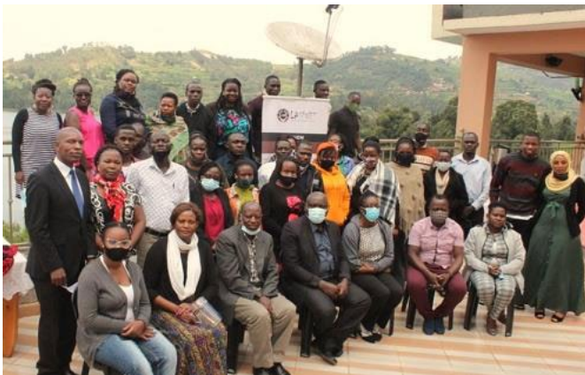
Staff and Board of Directors (Outgoing and Incoming) at the Retreat