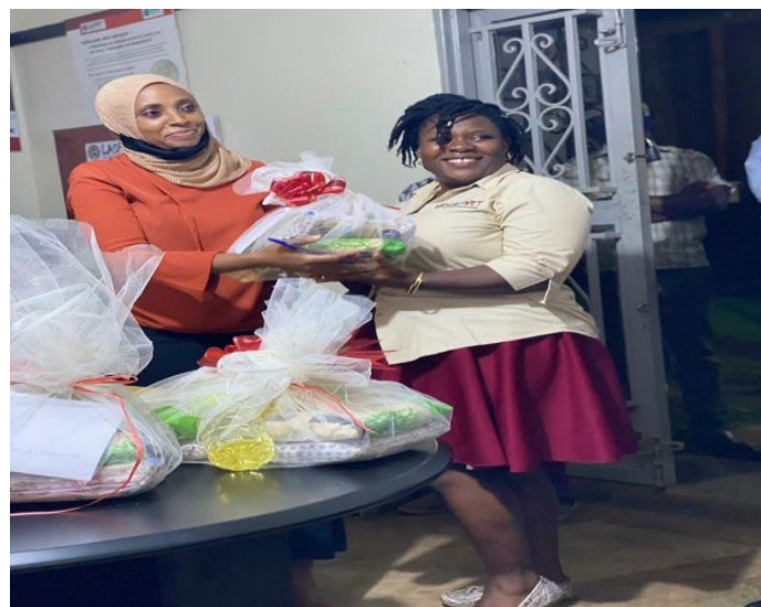
Staff receive their holiday package from Management before breaking off for the Christmas Holiday