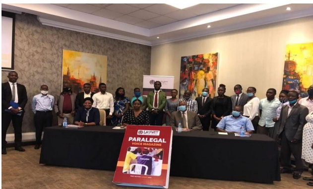
A group photo of the participants at the Dialogue