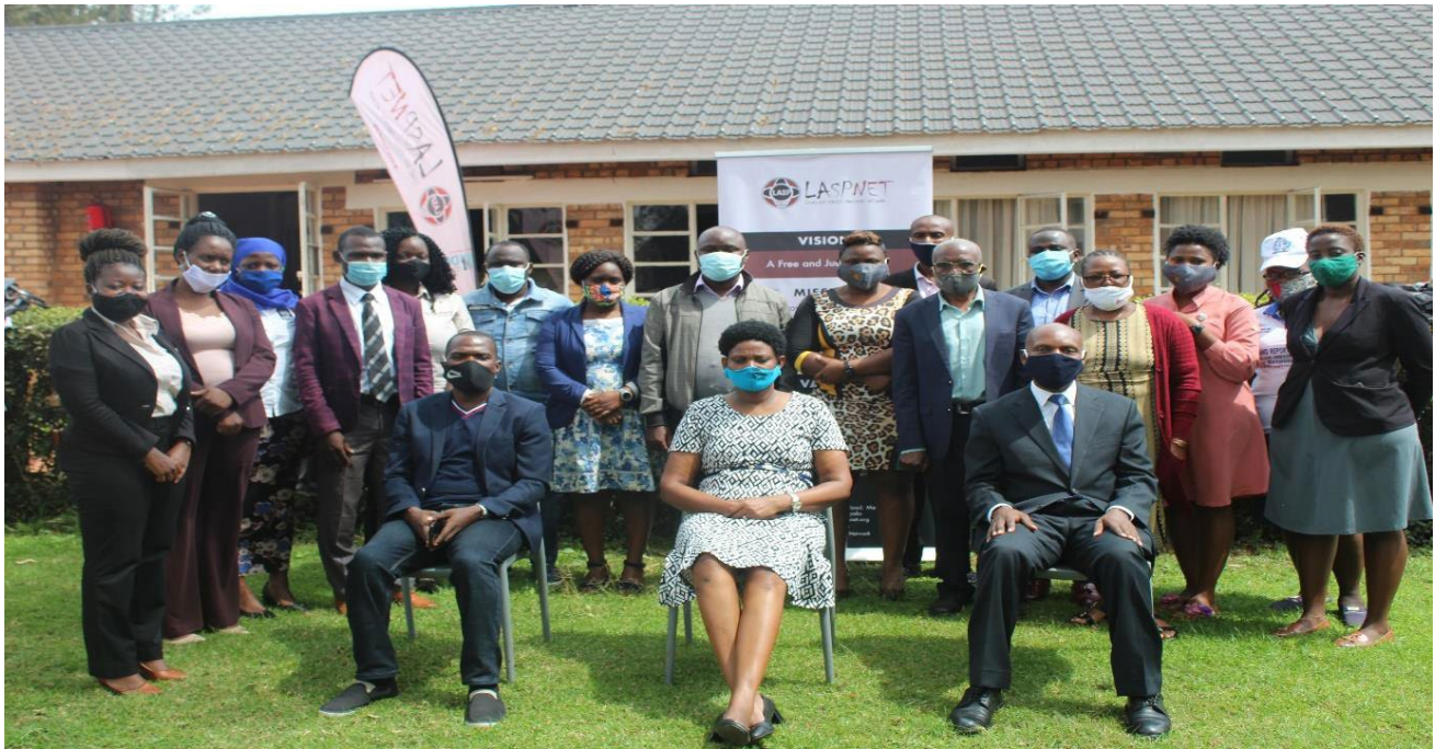
Participants for the Western PLE visit pose for a group photo.