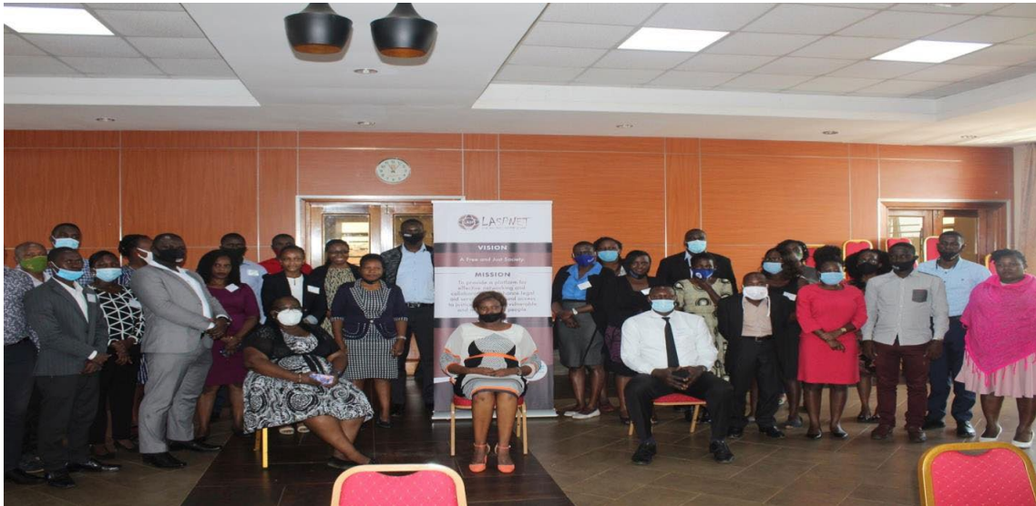
A group photo of participants at the Lobby and Advocacy training held on 15th and 16th December

the lobby and advocacy training was the creation of the Lobby and Advocacy WhatsApp group where members will continuously bond and engage on various issues concerned with Access to Justice; Human Rights and Rule of Law.