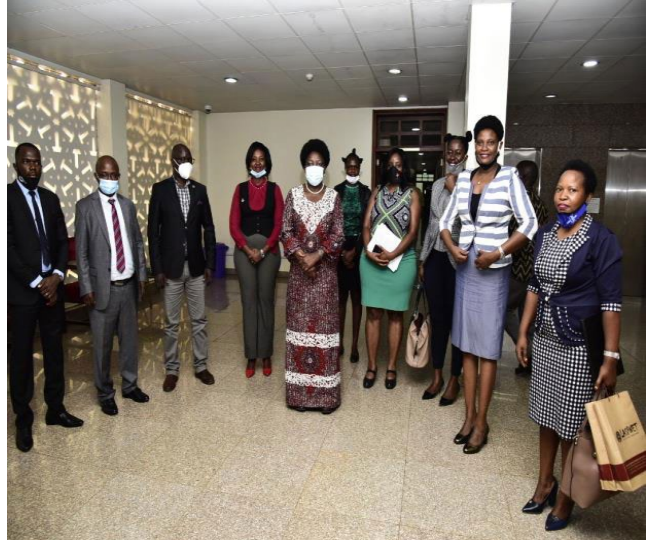
LASPNET Team led by the CEO together with Greater North Parliamentary Forum and the Legal Aid National Working Technical Committee meet the Speaker of Parliament Rt. Hon. Rebecca Alitwala Kadaga on the National Legal Aid Law on 11th September 2020