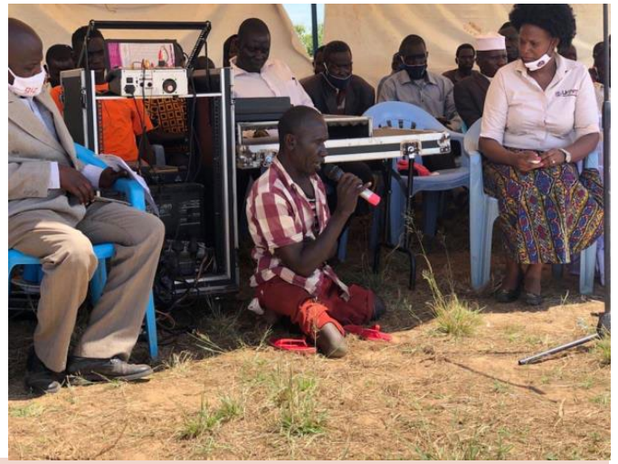
Clients receive legal advice during the Soroti Legal Aid Open day and Legal Aid Outreach at Rhino Camp