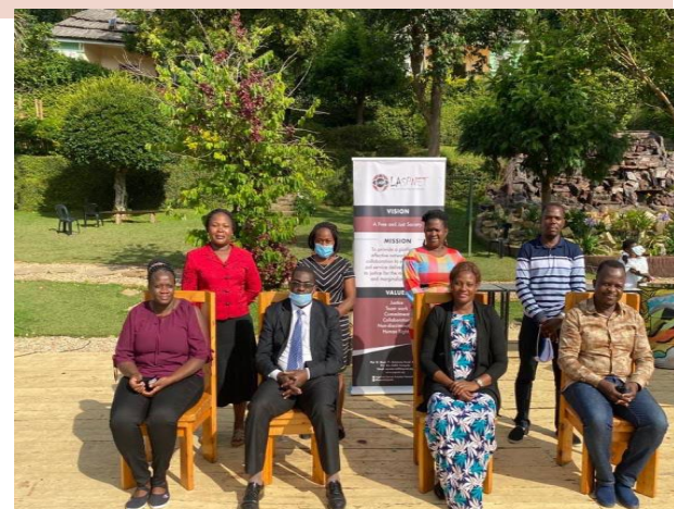
LASPNET Board of Directors Of Directors at the Board Handover.