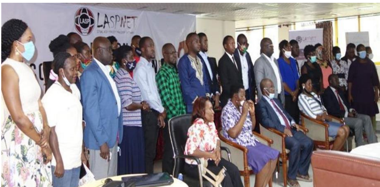
A group photo of the participants at the Dialogue on General Elections held on 11th September 2020

The panelists while digesting the past and current events seemed to agree with the status quo on escalating violations of rights of HRDs and called for multi-pronged strategies to ensure safety of HRDs which include working in coalitions; minding personal security and wellness. The dialogue was closed by Commissioner Stephen Tashobya who commended LASPNET for its visibility and steadfastness in promoting access to justice and human rights in Uganda. He called upon the Network to seek accreditation status from the Electoral Commission in order to participate in the election observation mission.