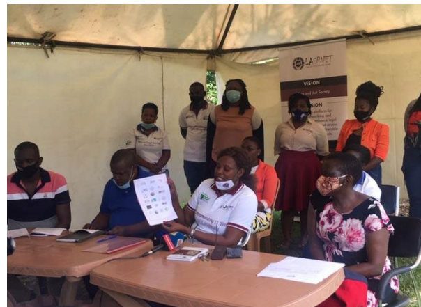
Press conferences in motion.

The above press statements and petitions have significantly enabled LASPNET to respond to human rights violations and abuses in the country. In other instances, the recommendations from these statements have been taken on by the duty bearers for instance the withdrawal of LDUs from the streets to undergo refresher training as well as the increased calls for peace during the 2021 elections was a result of LASPNET's advocacy efforts in form of press statements and petitions.