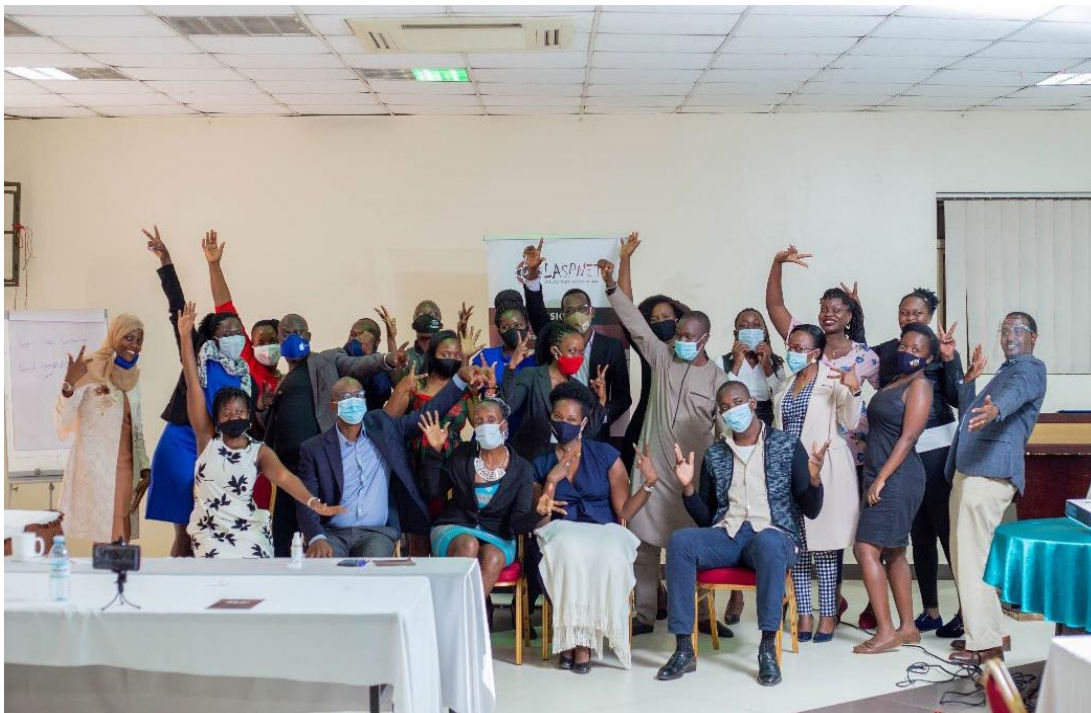
Participants at the closing Ceremony of the training