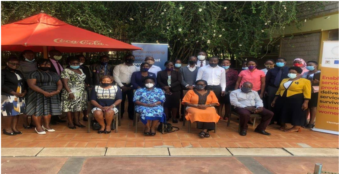
Group photo of the participants, Secretariat staff and facilitators at the SGBV Training on 16th and 17th December 2020

LASPNET conducted a 2-day thematic training for LASPs on how to respond to and handle cases of SGBV.