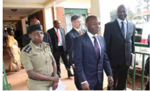
Hon Justice Olive Kazaarwe of the Family Division of the High court leading the court users Committee to inspect facilities at the court. The Administrator General is features in figure 2