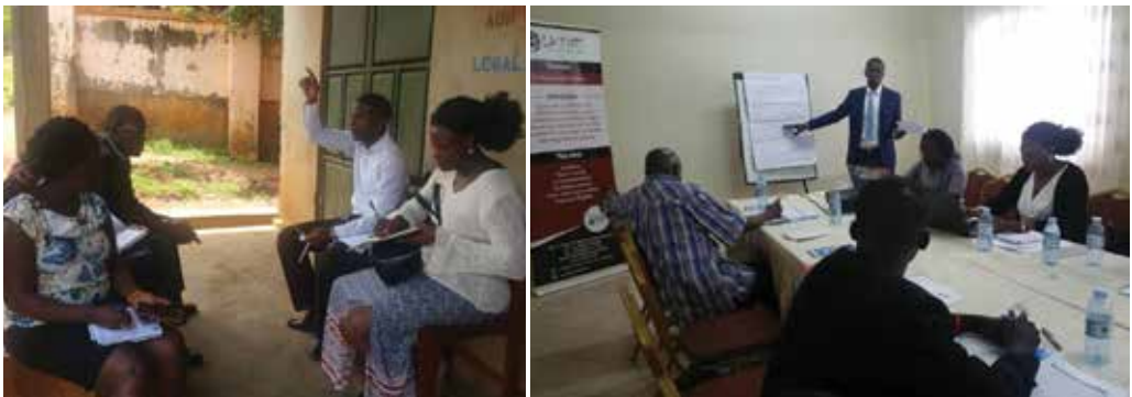
Group discussion on access to issues to justice issues with the regional LASPs in western Uganda.

The regional feedback also reveals rampant corruption amongst institutions like police and judiciary and with the police and using excessive force to effect arrest coupled with delay to investigate mainly due to resource constraint. On a lighter note though The ODPP in west especially Mbarara was commended for improvement in support of investigations and efforts to fight corruption. The details of the findings and opinion are reflected in matrix tow to this report.