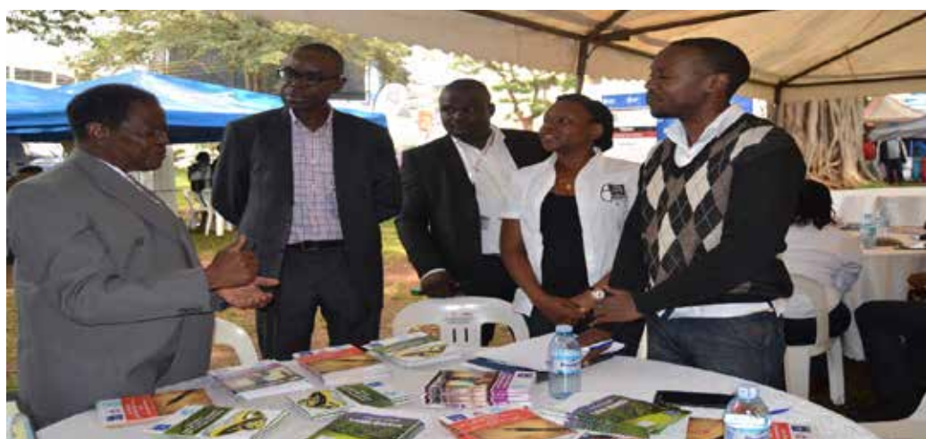
Hon Justice Remmy Kasule of Court of Appeal and Chairperson Uganda Law Council Inspects the ULS Stall at the LASPNET- NSSF Legal aid Open day.

On the 7 th December 2017, LASPNET with support from the National Social Security Fund (NSSF) organized a legal aid day aimed at extending legal services sensitizing LASPs and the general public about the mandate of NSSF and compliance requirements. This was graced by the Hon. Justice Remmy Kasule, Chairperson of Uganda Law Council.