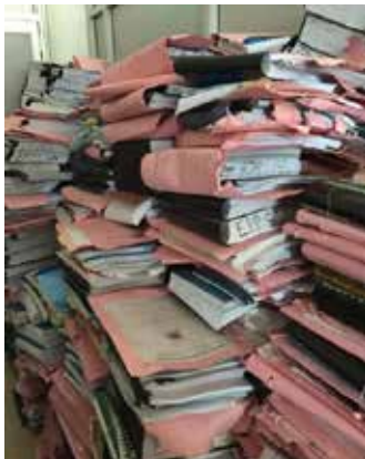
Before: Poorly archived files at the Family Court Division.

The Electronic Court Case Management Information System will greatly contribute to the Case Backlog reduction through provision of: Real-Time access to case information by all the parties in that particular case; A digitized court case file that will eliminate case file loss of misplacement and Electronic exchange of legal documents. Hon. Chief Justice Bart Katureebe.