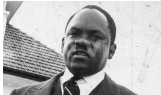
Advocates in attendance at the Inaugural Benedicto Kiwanuka CJ public Lecture