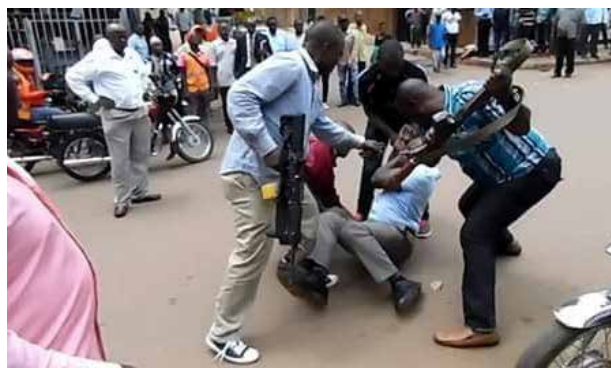
Security agents execute brutal arrest tainting principles of access to justice: image source Daily monitor October 19th 2018, Social Media.