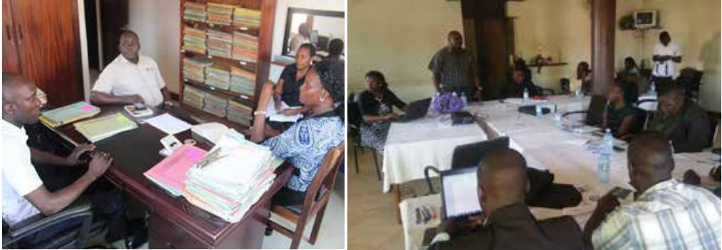
The Assistant legal officer ULS Jinja having a discussion with LASPNET Team, figure 2 The Northern Uganda regional engagements.