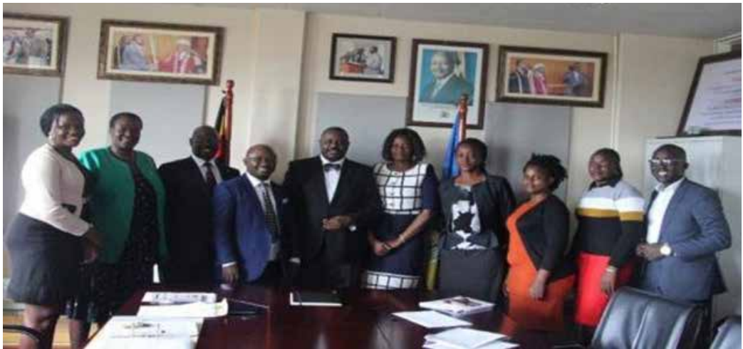
L-R: LASPNET National technical working committee for NLAP meeting with the Hon Jacob Oulanyah Deputy Speaker Parliament.