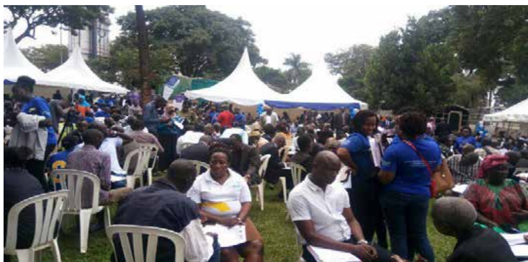
Advocates providing pro-bono services at ULS Annual Pro-bono day on 22 nd June 2018.