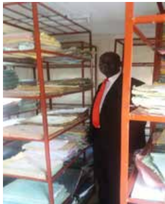
After: Innovative improvised filing system at the family division amidst constraints.