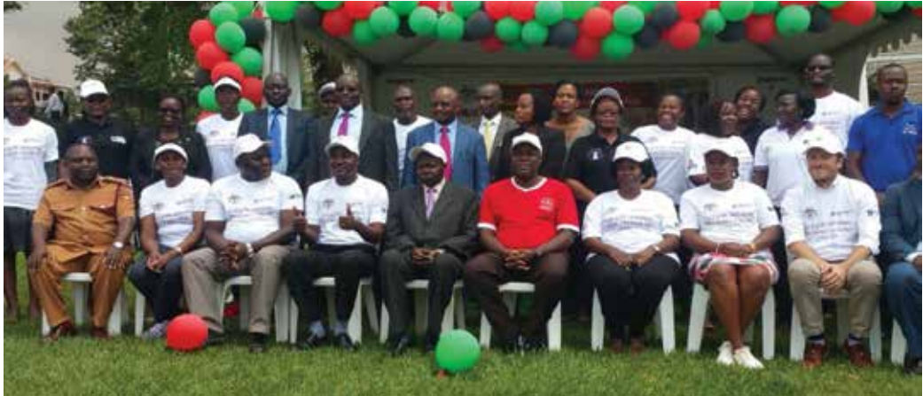
Group picture of stakeholders at the Pro-bono - Legal Aid day SOL @50 at MUK grounds.