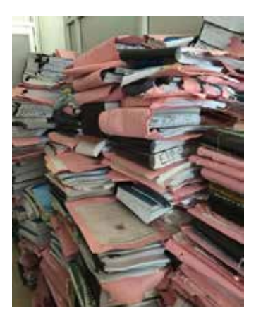
Before: Poorly archived files at the Family Court Division.

The Electronic Court Case Management Information System will greatly contribute to the Case Backlog reduction through provision of: Real-Time access to case information by all the parties in that particular case; A digitized court case file that will eliminate case file loss of misplacement and Electronic exchange of legal documents. Hon, Chief Justice Bart Katureebe.