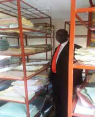
After: Innovative improvised filing system at the family division amidst constraints.