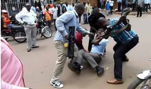
Security agents execute brutal arrest tainting principles of access to justice: image source Daily monitor October 19th 2018. Social Media.