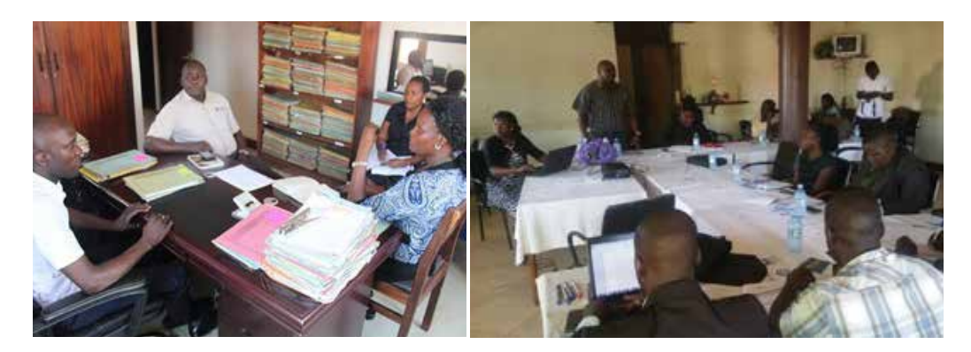
The Assistant legal officer ULS Jinja having a discussion with LASPNET Team, figure 2 The Northern Uganda regional engagements.