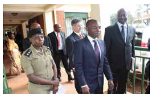
Hon Justice Olive Kazaarwe of the Family Division of the High court leading the court users Committee to inspect facilities at the court. The Administrator General is features in figure 2