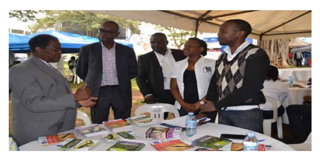
Hon Justice Remmy Kasule of Court of Appeal and Chairperson Uganda Law Council Inspects the ULS Stall at the LASPNET- NSSF Legal aid Open day.

On the 7<sup>th</sup> December 2017, LASPNET with support from the National Social Security Fund (NSSF) organized a legal aid day aimed at extending legal services sensitizing LASPs and the general public about the mandate of NSSF and compliance requirements. This was graced by the Hon. Justice Remmy Kasule, Chairperson of Uganda Law Council.