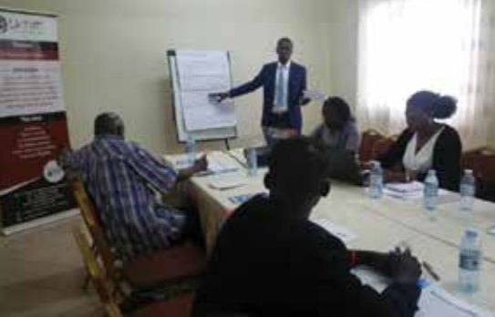
Group discussion on access to issues to justice issues with the regional LASPS in western Uganda.