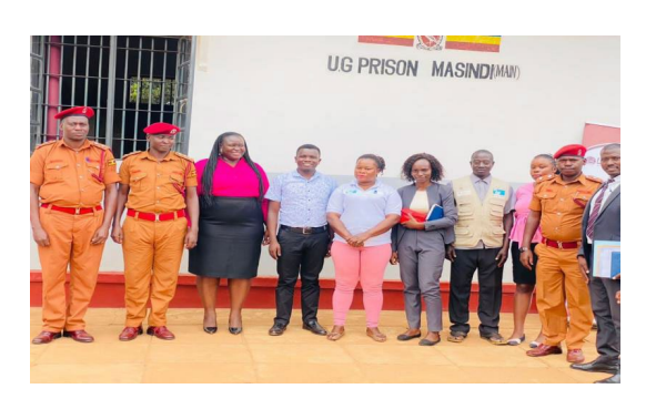
LASPNET team and legal team from different LASPs posing in a group picture with a team from Masindi main prison

ASF together with LASPNET conducted two (2) support visits to LASPs working under the Pre-Trial Detention- PTD project as well as stakeholders from the Access to Justice Sub Programme including Police, Judiciary and ODPP from the Albertine and Central Regions.