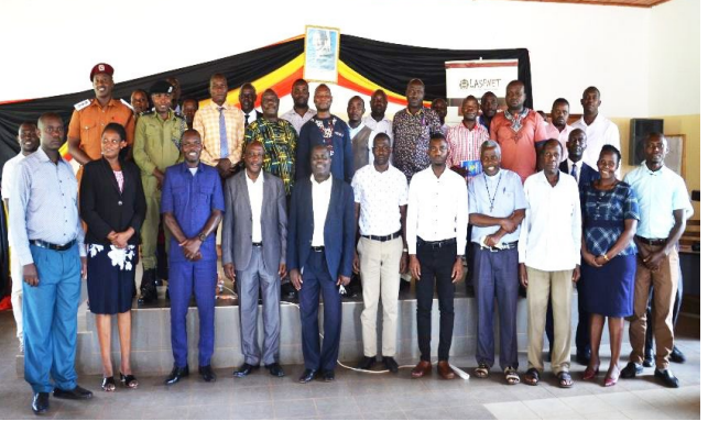
A photo moment of all participants at the town hall of Kibaale district on 19th December 2023 during the UNODC inception meetings