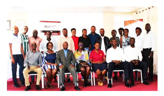
Participants pose for a photo at the Training of LASPs on the Utilization and application of the training Curriculum at Eureka Hotel

capacity building trainings organized by LASPs and yet each organization has their own training methodologies, structures and content which manifested the lack of a well-structured framework to follow that would provide for standardized skills and knowledge which prompted LASPNET with the support of IDLO to engage a consultant to undertake the development of a training curriculum for LASPs in order harmonize and standardize the approaches to training.