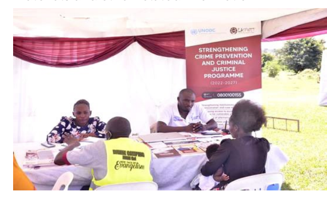
LASPNET team of lawyers offering legal advice during legal camp in Kayunga district

A full week event featured activities such as door to door evangelism, daily crusades, community charitable work such as construction of water sources, medical and legal aid services. Specifically, the Legal aid camp featured setting up of legal aid desks by participating Legal Aid Service Providers in order provide legal aid ad advisory support services including advice and counselling, mediation, sharing or IEC materials and other related information